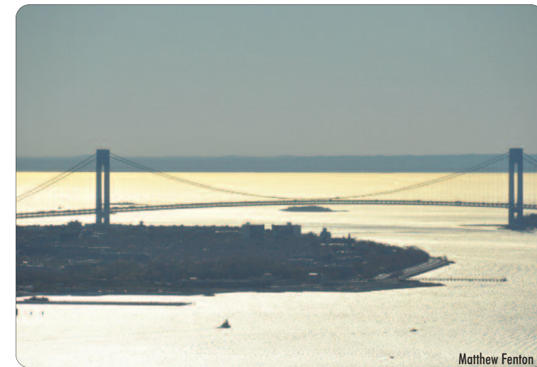
Looking south from the top of Four World Trade Center, an observer could be forgiven for imagining that the view is so vast as to make visible the curvature of the Earth. This is an illusion created by the arched deck of Verrazano-Narrows Bridge. But that span is so long, and its towers so tall, that they do take into account the planet's roundness: Its twin spires are slightly more than 1.5 inches farther apart at the tops than at their bases.

of bronze and glass. Considered one of the greatest icons of twentieth-century architecture, the building was commissioned by Samuel Bronfman, founder of the Canadian distillery dynasty Seagram. Bronfman's daughter Phyllis Lambert was twenty-seven years old when she took over the search for an architect and chose Mies van der Rohe